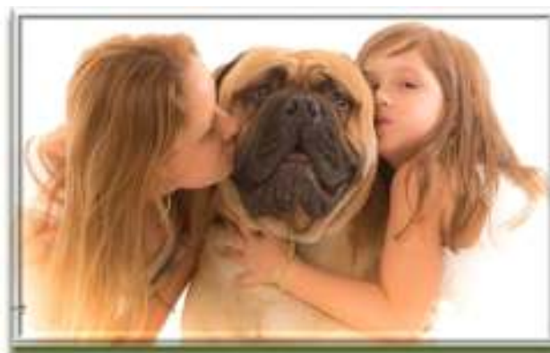
Crufts winner 2015 – an Australian Bullmastiff