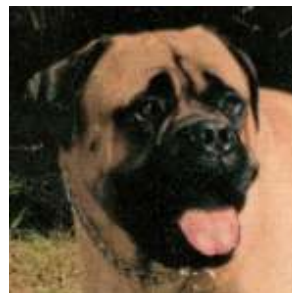
This MBISS winner died from a Rinkhals bite and this fawn boy was killed by a puff adder