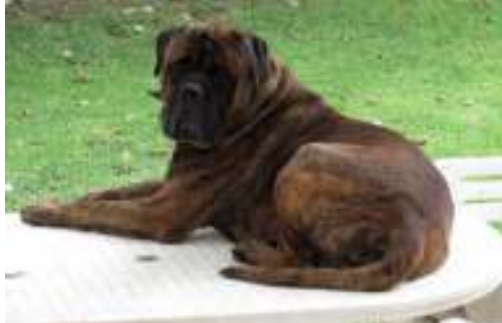
This dog is into 'table comfort'

Submit your 'wacky or wonderful' photos' to info@capebullmastiffclub.co.za and share them with us.