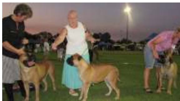
What a treat 😊