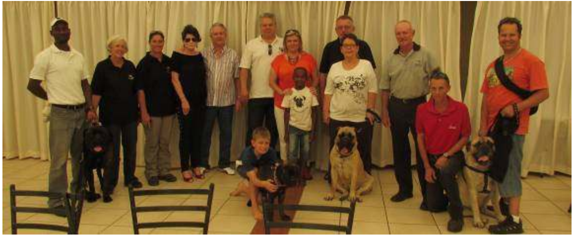
An amazing group of people with their Bullmastiffs ☺