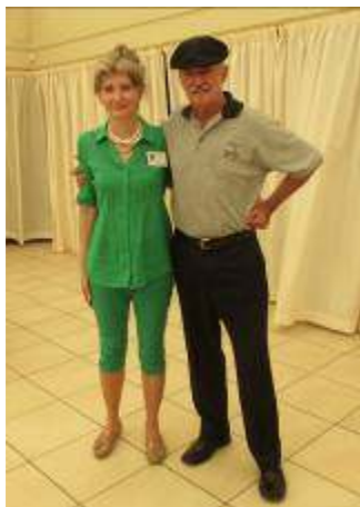
Patron & Chairlady