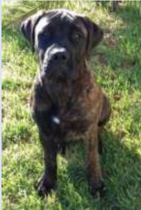
LOYANION SANNA -Lizel Seiberhagen