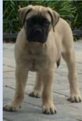
LAGRATITUDE PADDINGTON BEAR